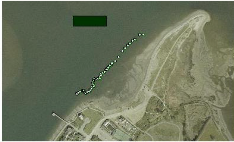
Figure 5: FOSBS 2003 Eelgrass mapping, Blackie Spit